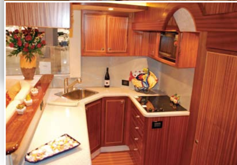
The Element's "tailgate" transom lowers to the deck, left, opening up the aft cockpit for water-sports adventures. The master stateroom, above left, is one of two private cabins on this 40-footer. The galley, above right, offers generous storage space.

fewer VOC emissions and less air pollution. Our run aboard Hull #1 revealed two unique features for a boat of this size. The first, and most obvious, was the drop-down transom, which operates like a pickup truck tailgate. The second is access to the engine and machinery space through a cockpit door that can remain open even when running without creating traffic problems for those on board.